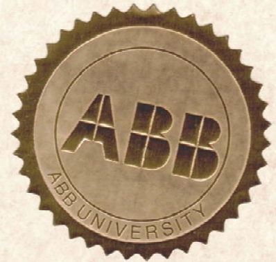
ABB University Training Center Oslo